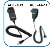
Heavy Duty DTMF Mobile Mic (ACC-709) Heavy Duty Mobile Mic (ACC-4473)