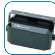
Heavy Duty Remote Speaker (AA-1470A)