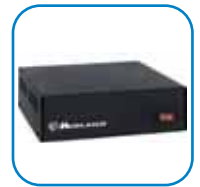
Base Station Power Supply 110V/220V AC (MS-0730)