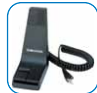
Base Station Microphone (ACC-704)