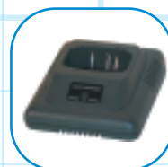
SINGLE UNIT RAPID RATE DESKTOP CHARGER (B1-390)