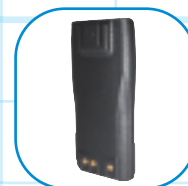
BATTERY PACK 1300 MAH NiMH BATTERY (1B-B02)