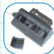
6 STATION GANG CHARGER (ACC-460) CHARGER CUP (ACC-464) REQUIRED

MIDLAND RADIO CORPORATION 5900 PARRETTA DRIVE KANSAS CITY, MO 64120 USA TEL: 816-241-8500 FAX: 816-241-5713 EMAIL: MAIL@MIDLANDRADIO.COM WWW.MIDLANDRADIO.COM