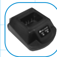
SINGLE UNIT "SMART" CHARGER BASE (ACC-470) CHARGER CUP ACC-476 REQUIRED