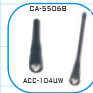
UHF ANTENNA 6" STUD MOUNT (CA-5506B) UHF ANTENNA 440-470 MHZ (ACC-104UW)