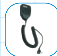
SPEAKER MIC W/ ANGLED CONNECTOR (QPA-1421)