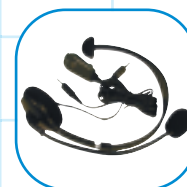
BOOM MIC HEADSET (22-540)