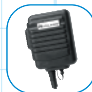
WEATHERPROOF SPEAKER MIC (70-M45WP)