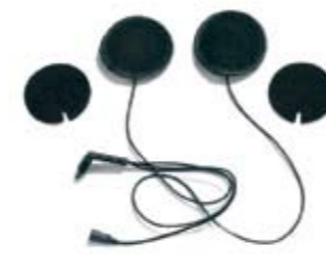
BTH102 HI FI Speakers