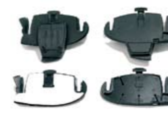
BTA101 Replacement Mounting Kit