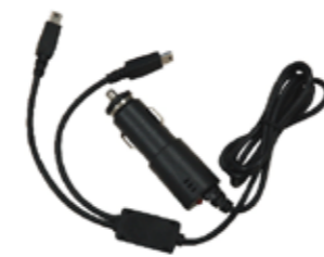
BTA201 12V Cigarette Charger