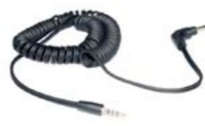
BTA301 Auxiliary Cable