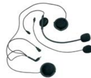
BTH101 Replacement Headset Kit