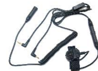
BTA302 GMRS Cable